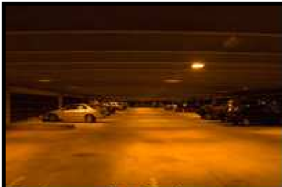
Before: Raleigh garage with high-pressure sodium lighting

Whiter light than HPS, reduce light pollution