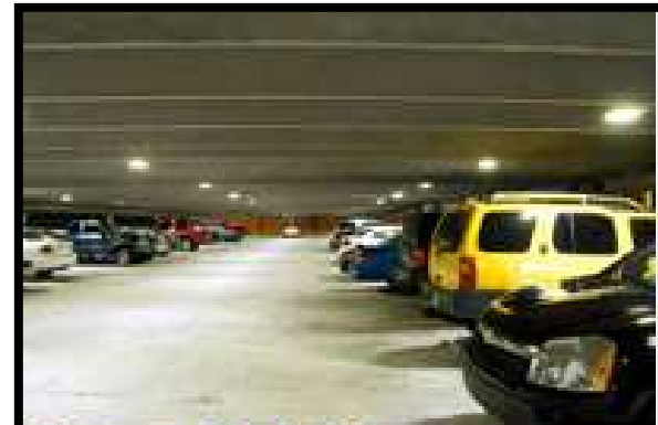
After: Raleigh garage after installation of LED lights